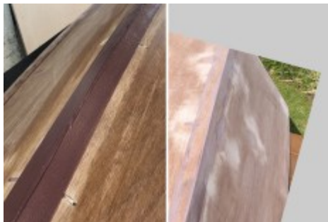
Left: Filler applied Right: Excess filler sanded off

With a number of elements in place there was still no deck in place so the section could be turned over to fill the external chine. A filler mix of AMPRO™ and microballoons was applied up to the edge of the original rebate for the laminate. A good tip is not to apply more than you need as this will only need sanding off after.