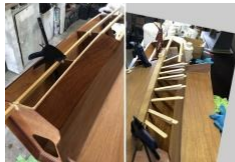
Left: Final deck rib fitting Right: Top deck curing

With the first section of deck cured, profiled and the internals coated, it was time to fit the deck rib and the last section of deck. As with a real build, the internal surfaces were coated with two coats of AMPRO™ seal and then bonded, without any cleaning of the internals. Creative clamping is often required in these situations, mixing sticks are ideal for packing and wedging!