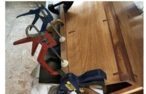
Bonding & clamping the rubbing strake

The last piece of structure to be added was the rubbing strake. This was bonded on using a AMPRO™ mixed with Microballoons to ensure a similar colour match to the wood. In this instance, no screws were used, which may not be practical on a full size build. With the rubbing strake rounded and faired into the deck, the structure is finished.