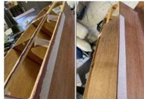
Left: Adhesive applied to bonding surfaces Right: Oversize deck section positioned

For the deck, an oversized piece of plywood was used to give a nice colour contrast, which was bonded using a mix of AMPRO™ and Microballoons applied to the deck ribs and bulkhead tops. Once cured, the oversized deck section was then planed to achieve a perfect fit.