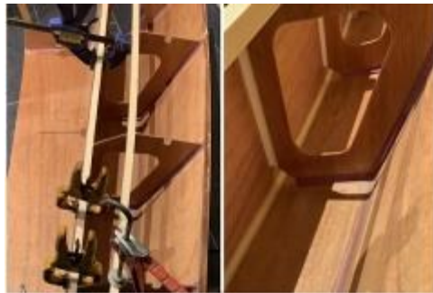
Left: Two deck ribs fitted Right: All types of fillet used

Then two of the three deck ribs were fitted, which would still allow access to complete most of the inside fillets. The fillets to the inside of the longitudinal bulkhead were made using a mix of AMPRO™ and Glass Bubbles. More commonly these joints would use microballoons as these are the lightest form of fillet, however since we wanted a piece that demonstrated the full range of fillers available, glass bubbles were used. With the internal fillets completed, all of the inner surfaces of the buoyancy tank were then given a final coat of AMPRO™ SEAL.